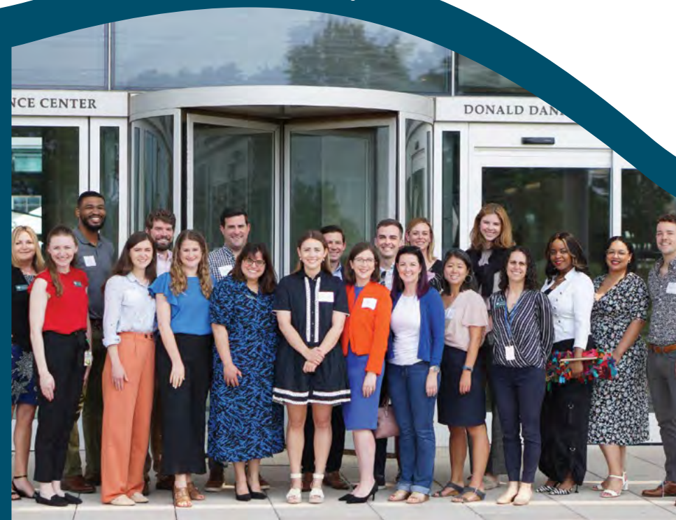
• 40 under 40