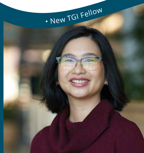
• New TGI Fellow