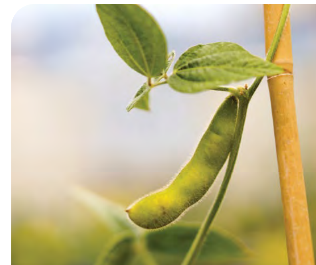
Soybean pod. Stewart Morley in the Allen lab led a study documenting soybean seed metabolism that resulted in increased seed oil production.