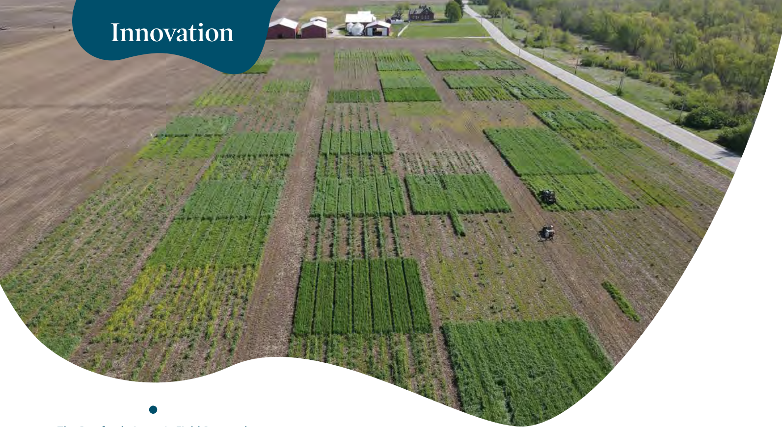
The Danforth Center's Field Research Site, only about 25 minutes from the Center, is a crucial new facility for plant research.