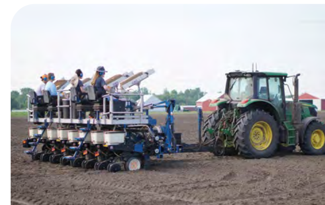
One of eight labs running experiments at the Field Site using a GPS-enabled precision planter.