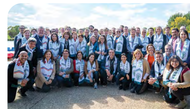
Cultivar STL is the new strategic effort to strengthen partnerships with Latin America.

St. Louis is set to enhance its global presence in the agri-food tech sector with the launch of Cultivar STL. This strategic effort, led by prominent organizations such as the Danforth Center, BioSTL, and the World Trade Center St. Louis, aims to strengthen partnerships with Latin American counterparts, promoting economic growth and contributing to global food security. The initiative kicked off in October with a visit from over 30 startup executives, investors, and ecosystem builders from nine Latin American countries. Read more on our website.