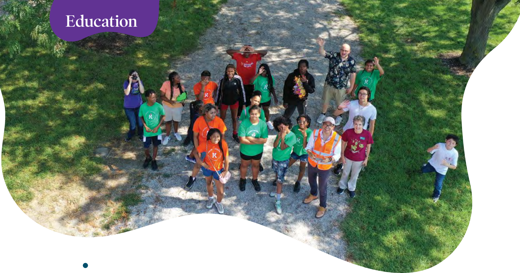
With support from Boeing, the Danforth Center “piloted” a new geospatial summer opportunity for middle-schoolers this year: Drone Ranger Camp.