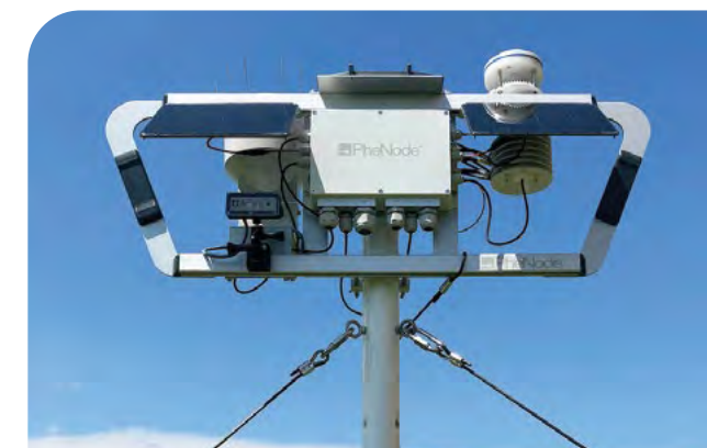
The PheNode ® is the pilot launch of Agrela Ecosystems, a Danforth Center spinout.