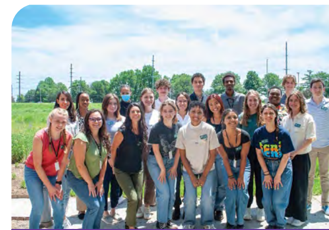
The 2023 REU class concluded their summer internship by gaining practical, hands-on experience in labs utilizing state-of-the-art tools and techniques.