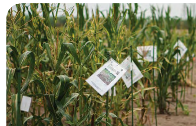
A corner of the Maize Maze, a project of the Eveland lab, which provided educational opportunities.