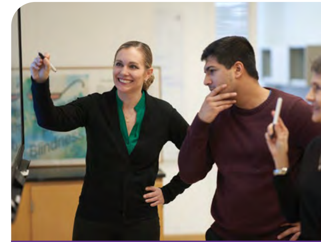
Danforth Center Education Research and Outreach lab is partnering with St. Louis Community College on the EMBARK program for high-school students.

Each summer, the Danforth Center opens its doors to exceptional undergraduate students from all corners of the nation, welcoming them into the Research Experience for Undergraduates (REU) internship program. This transformative experience equips budding scientists with hands-on exposure to the intricacies of modern scientific research, from designing experiments to conducting them alongside world-class plant scientists. Made possible by the National Science Foundation , the program aims to shape the next generation of scientists to tackle the most significant challenges of our era. The class of 2023 is motivated by a desire to play a pivotal role in devising solutions for climate change, clean energy, ecosystem restoration, and sustainable agriculture. Visit the Danforth Center’s blog to meet some of this year’s team and learn how they hope to change the world.