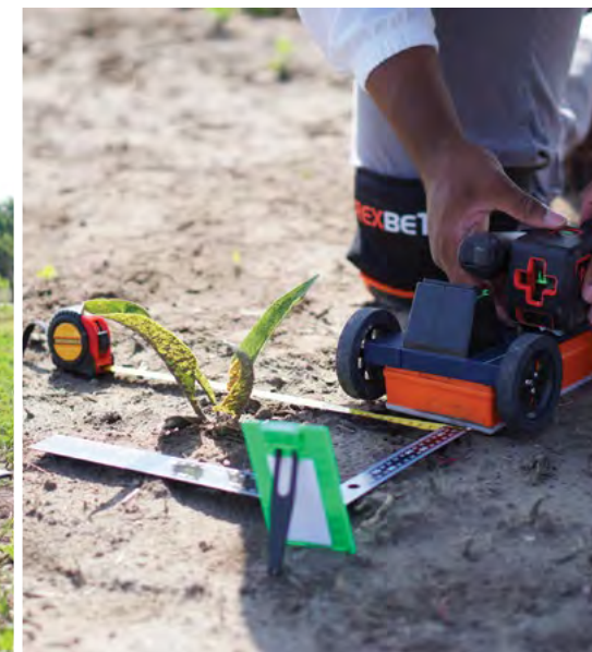
Left: The Danforth Center partnership with Taylor Geospatial Institute has flourished in the field where geospatial tools like drones assist in data capture.